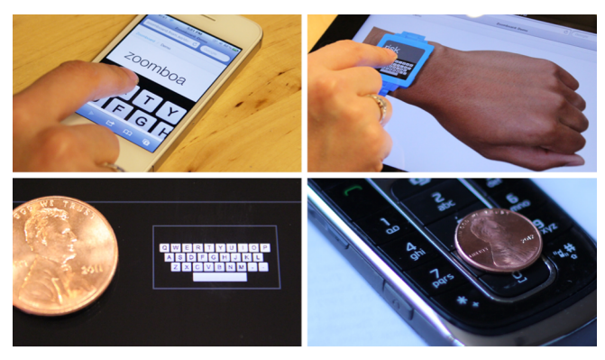
Figure 2: ZoomBoard could be used on a variety of device sizes, for example a smartphone (top left), watch (top right; simulated on a iPad), or coin-sized (bottom left). For size comparison, a typical physical number keypad (bottom right).

device enclosures and touchscreens [14]. However, fitting 27+ keys onto a small device is neither straightforward, nor particularly accurate. It is now standard for touchscreen keyboards to feature real-time spelling correction, simply because it is assumed that users are unable to accurately hit such small keys. However, this approach carries the significant benefit of being instantly familiar to users. Indeed, the latter property has been a driving factor in the consumer space, and most text produced today on smart devices is by miniature QWERTY keyboards. Further, given the number of keys required and our "fat fingers", it seems unlikely a full keyboard layout can be shrunk much further.