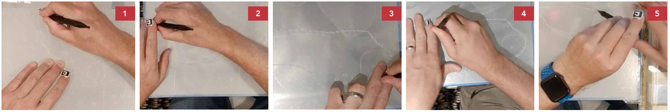
Figure 3. Hand postures observed during creation of tactile graphics. From left to right: (1) Stabilizing (2) Anchoring (3) Finger Splitting (4) Finger as a Guide (5) Stylus Balancing

purposes. They would hold the stylus at the last drawn point with the non-drawing hand.