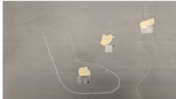
Figure 1. A tactile map of a park created by participant P6 in our study. He preferred using both braille and audio labels, and chose a differently textured tactile marker (paper tape) to represent audio information.

http://dx.doi.org/10.1145/3313831.3376349