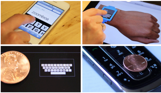
Figure 2: ZoomBoard could be used on a variety of device sizes, for example a smartphone (top left), watch (top right; simulated on a iPad), or coin-sized (bottom left). For size comparison, a typical physical number keypad (bottom right).

device enclosures and touchscreens [14]. However, fitting 27+ keys onto a small device is neither straightforward, nor particularly accurate. It is now standard for touchscreen keyboards to feature real-time spelling correction, simply because it is assumed that users are unable to accurately hit such small keys. However, this approach carries the significant benefit of being instantly familiar to users. Indeed, the latter property has been a driving factor in the consumer space, and most text produced today on smart devices is by miniature QWERTY keyboards. Further, given the number of keys required and our “fat fingers”, it seems unlikely a full keyboard layout can be shrunk much further.