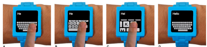
Figure 1: ZoomBoard on a watch-sized device. The keyboard is fully zoomed out by default (A). When users press a key, the keyboard iteratively zooms in (B & C), until the keys are a size that is comfortable and accurate (C). After the desired character is entered, the keyboard resets (D). Users may also swipe to the left to delete, to the right for a space, and up to switch to a symbols keyboard.

The most direct approach to support text entry on mobile devices has been to find clever ways to shrink QWERTY keyboards, such that they can be accommodated on mobile